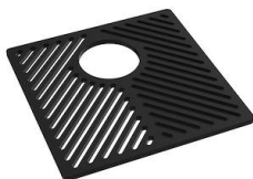
Black grid 8100 651