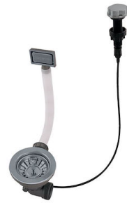
Gun Metal automatic waste fitting - PG 8407 110