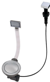
Space automatic waste fitting - PA 8407 108