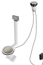
Space Light automatic waste fitting - PL 8407 117