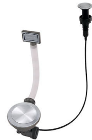
Space Push automatic waste fitting - PP 8407 116