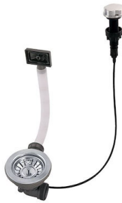
Automatic waste fitting 8407 000